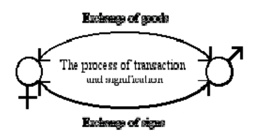
Figure 1: Interaction between two agents.

This means that culture becomes an abstraction that can support our interpretations of economic, political and social practice (from now on referred to as social practice), but it also means that social scientists are confronting a problem of observation. In the first place we have a problem of observation because an intersubjective system of meaning turns out as an abstraction which characterize invisible relations (Bærenholdt 1991). In the second place we can be confronted with a problem of observation because an intersubjective system of meaning can be embedded in systems of meaning that are unknown to the researcher (Collin 1985, Wadel 1991). Thirdly, we have a problem of observation because social practice becomes embedded in the tacit part of culture expressed by Bourdieu as 'the universe of the undiscussed<sup>a</sup> (1977) and by Giddens as 'unconscious<sup>a</sup> and 'practical consciousness<sup>a</sup> (1979).