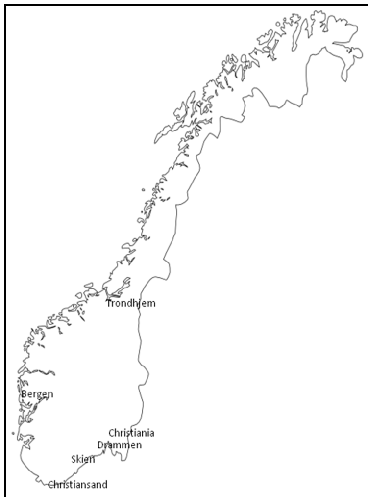
Map 1: The branches of Norges Bank