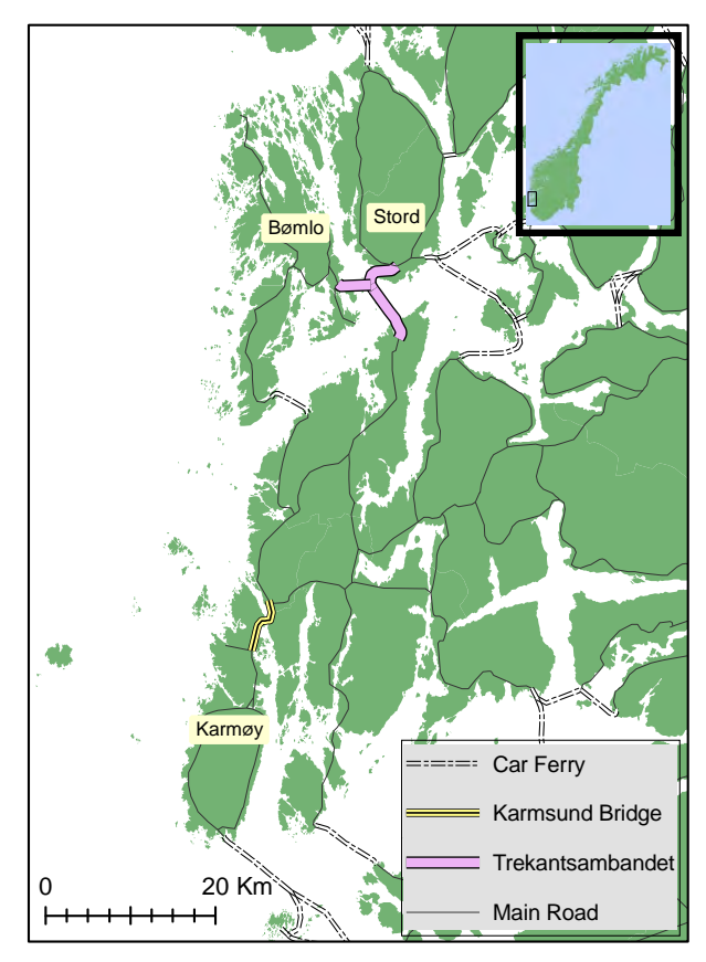
Figure 2: The regions of Nord-Rogaland and Sunnhordland showing the location of Trekantsambandet and the Karmsund Bridge.

The first entry in Table 6 shows the results for Trekantsambandet. A cursory visual inspection shows that all of the estimates lie in the correct order of magnitude. Of course, there is still significant variation among the models. This connection lies in the region of Sunnhordland. The most noteworthy point about the figures is that the predictions made with parameters from Sør-Rogaland outperform the estimates from Sunnhordland. This is surprising since the native parameter estimates are not the best predictor on this subset of the data. The worst predictions are offered by the parameters transferred from the adjacent region of Nord-Rogaland.