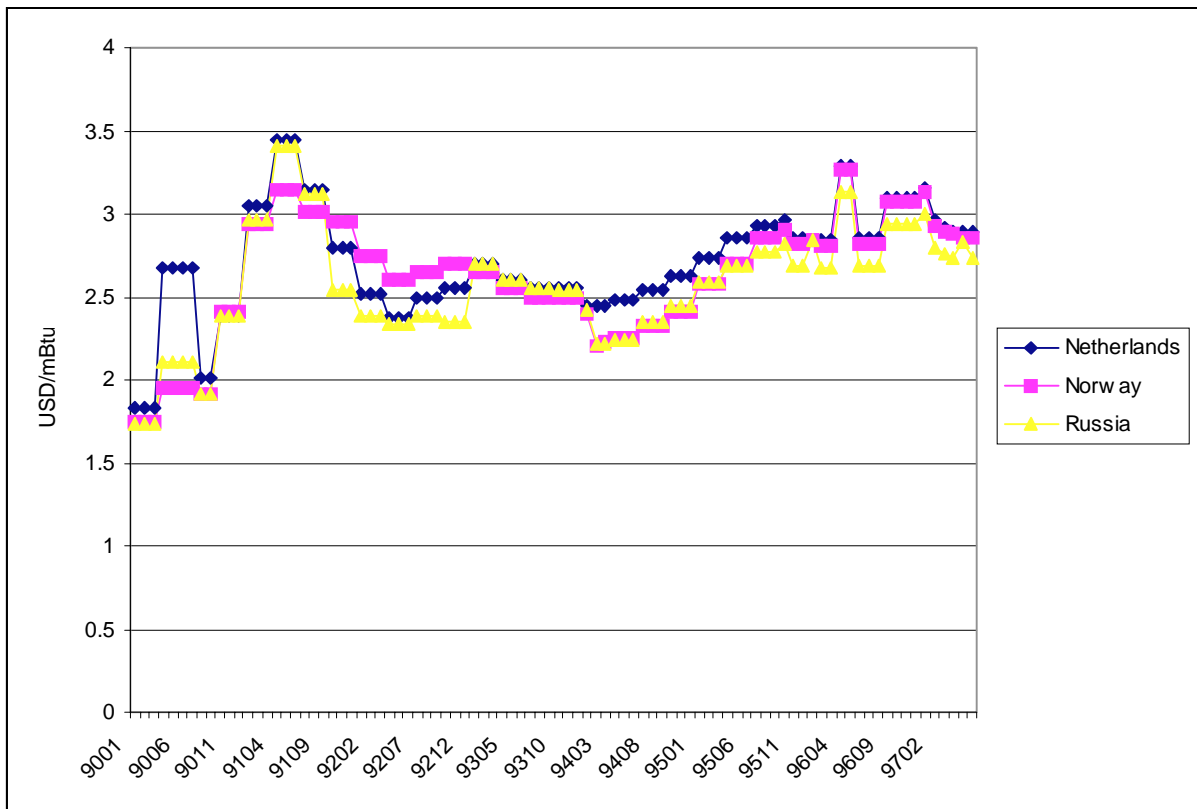
Figure 2. Import prices for natural gas from the Netherlands, Norway and Russia to Germany.