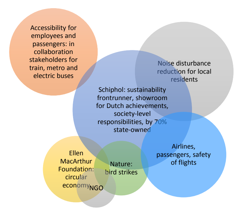
Fig. 5.1 Mapping Schiphol's stakeholders: