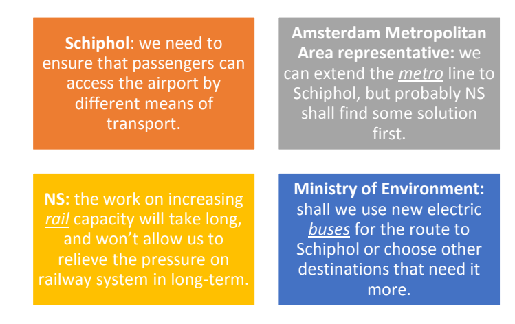
Fig. 4.2 Conflicting interests: