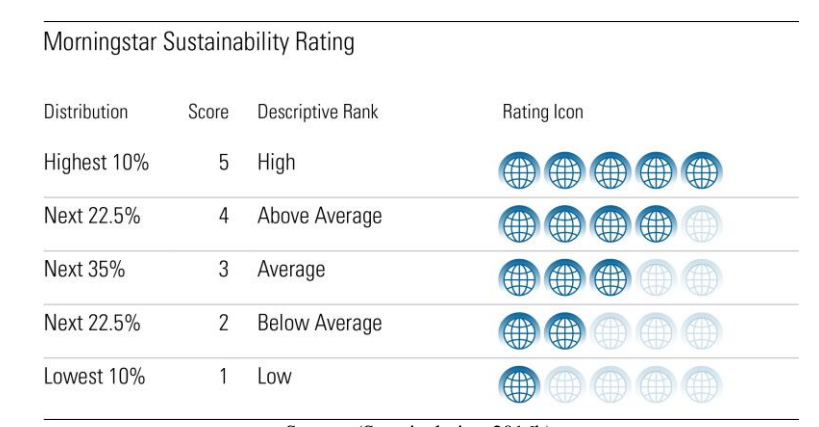
Figure 2 - Illustration of the distribution of Morningstar's Sustainability Rating

The Portfolio Controversy Score is the asset-weighted average of the company level controversy scores. Morningstar has their own method of rescaling the score to decide how much to deduct from the Portfolio ESG Score, in order to create the Portfolio Sustainability Score. When the funds receive their score, they get a Morningstar Sustainability Rating based on which quintile they belong to in their fund category. The ratings are distributed as follows: