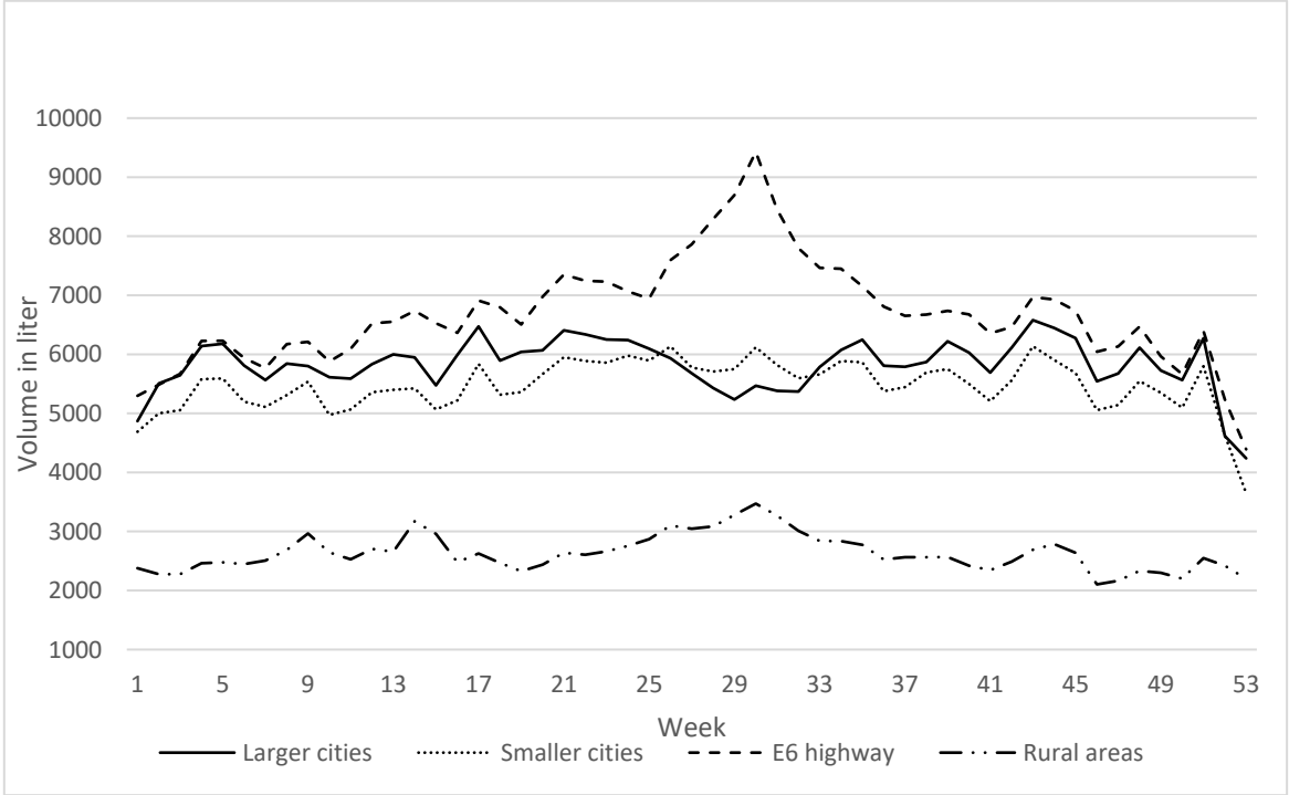
Figure 2: Average weekly quantity sold at the station level in different geographical regions. Sample period is 1 January 2012 to 31 December 2012.