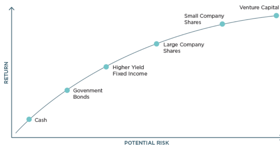
Figure 1: Illustrative risk-return profiles for different asset classes

VCs demand high returns for the risk they undertake. From 1960 to 1999, VC investments yielded an arithmetic return of 45% annually with a standard deviation of 115.6% (Baierl & Kaplan, 2002). Cochrane (2005) suggests several reasons why the risk-return ratio differs from public stocks. Other than the uncertainty of returns, he mentions illiquidity and that a larger fraction of total capital is often invested in each company. The latter implies higher risk through lower diversification. The risk-return profiles of different asset classes are depicted in Figure 1. With investment characteristics similar to those found in VC, we should expect to also find the risk-return ratio of equity crowdfunding close to that of VC.