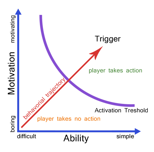
Figure 2- Fogg Behavior Model

into specific actions. In other words, successful gamification is all about making these three factors occur at the same time".