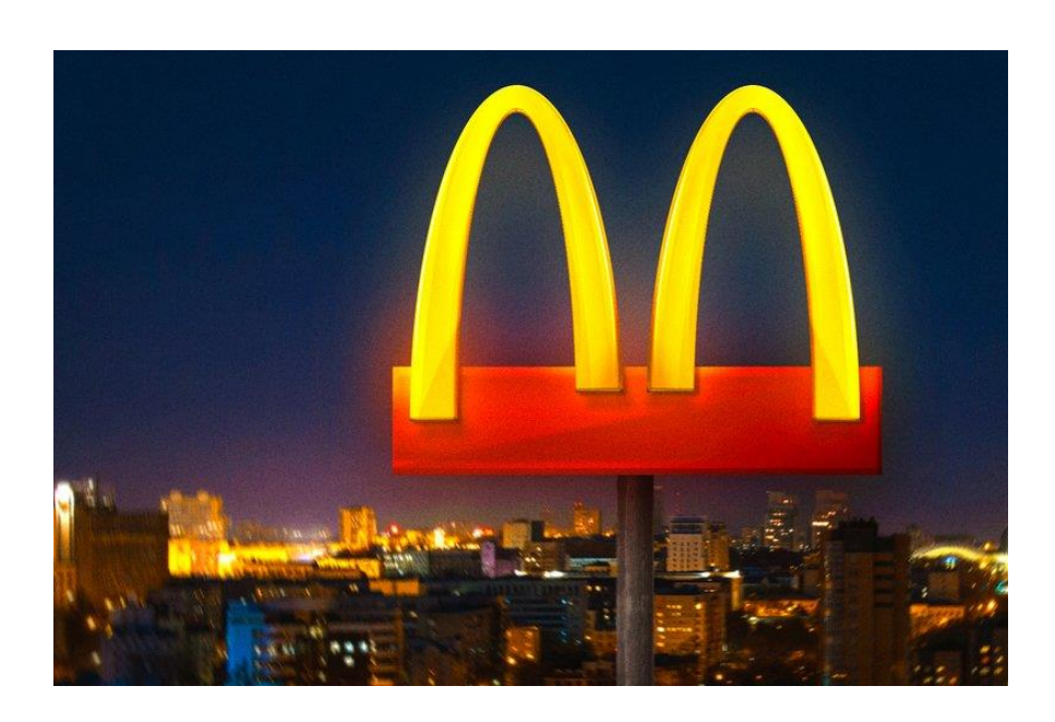
McDonald's Relief Response (Diaz, 2020)

Link shared during the interviews: <a href="https://s3-prod.adage.com/s3fs-public/styles/width-792/public/20200320">https://s3-prod.adage.com/s3fs-public/styles/width-792/public/20200320</a> mSeparated 3x2.jpg