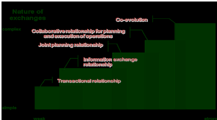
Fig. 1. Different levels of collaboration framework.

In this paper, we will discuss critical issues when building a coalition of business entities aiming for collaborative logistics. These issues are of different natures. After introducing opportunities for collaborative logistics, we will discuss which entities should be part of the coalition and who should decide about this? The second issue raised is how the coalition will share the benefits gained? The third aspect to be discussed is the need for specific information and decision technologies. Finally, a discussion will bring up problems related to collaborative logistics.