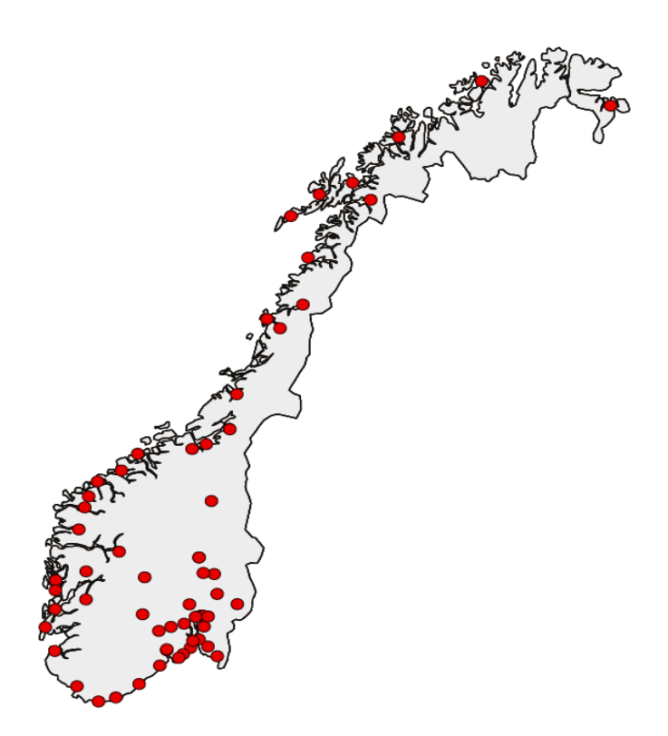
Figure 1. Distribution of NHS hospitals in Norway, 1998 – 2005.