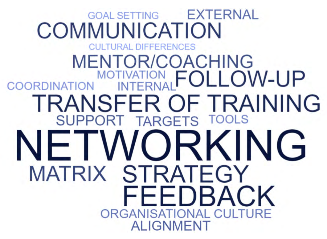
Figure 3. Word cloud of most used terms in the data collection

weaknesses of leadership development programs within the company? The word cloud below highlights some of the key terms that arose in the data collection process. The larger the word is in the cloud, the more frequently it was mentioned during the interviews. For example, networking was mentioned the most times in total by all the interviewees, so it is the biggest in the word cloud. As such, we focus on these terms in our analysis.