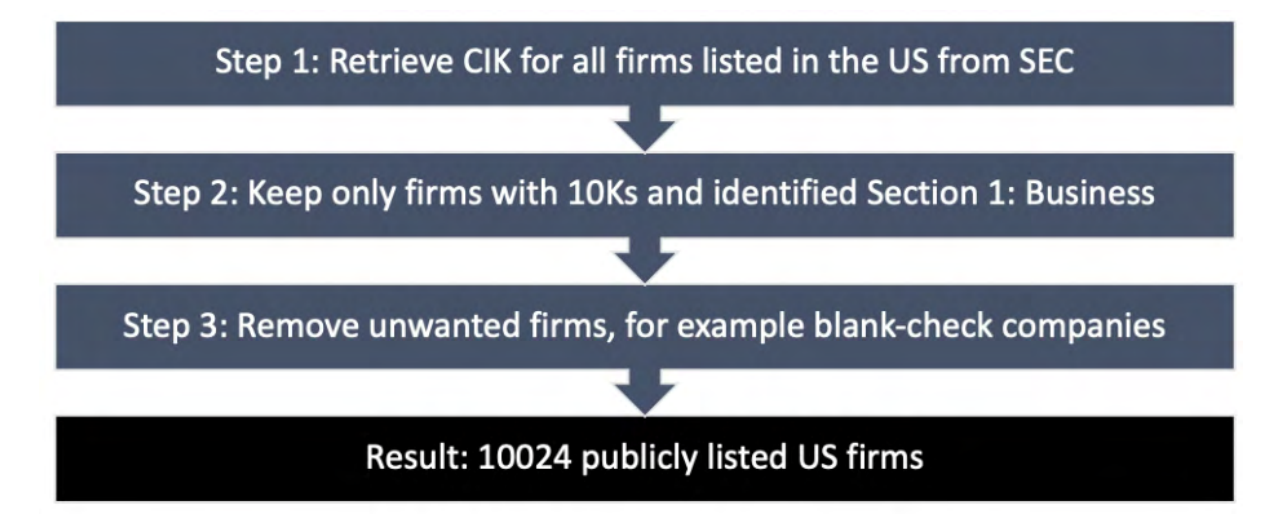
Figure 3.2: Identification of all relevant publicly listed US firms is simplified into four steps. First, retrieve all CIKs from the SEC. Retain only firms with 10Ks and separable Section 1. Remove non-operational firms using criteria established by literature. At last, retain 10024 firms to be used in the analysis.