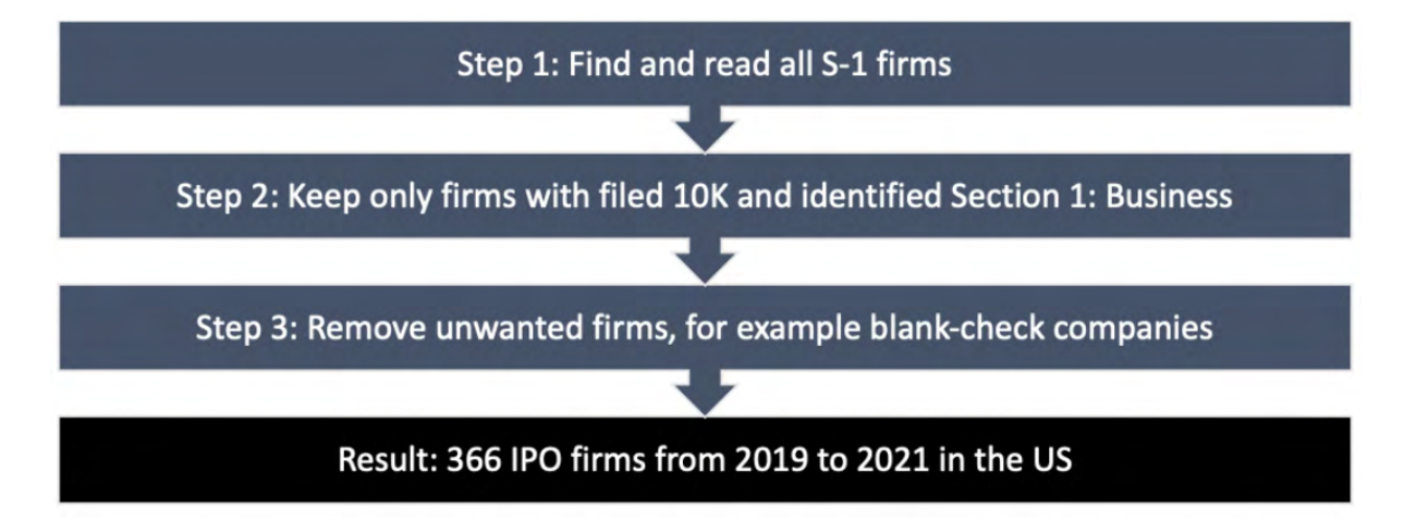
Figure 3.1: Identification of the relevant IPO firms that went public in the US between 2019 and 2021 is explained using four steps. First, engage the API offered by the SEC to read all S-1 forms. Retain only firms with 10Ks and separable Section 1. Remove non-operational firms using criteria established by literature. At last, retain 366 IPO firms to be used in the analysis.

We are interested in operational IPO firms and not simply holding companies. Following the methodology of Ritter and Scholar (2021), we remove all firms that are exclusively (1) holding companies, (2) acquisition companies, (3) investment companies (4) SPACs. We also remove all firms where Section 1 is not identified, i.e., the 10K report is not present in the database. These steps greatly reduce the number of IPO firms in our sample. The number of relevant IPO firms from 2019 to 2021 is 366, and the subsequent analysis is based on these firms.