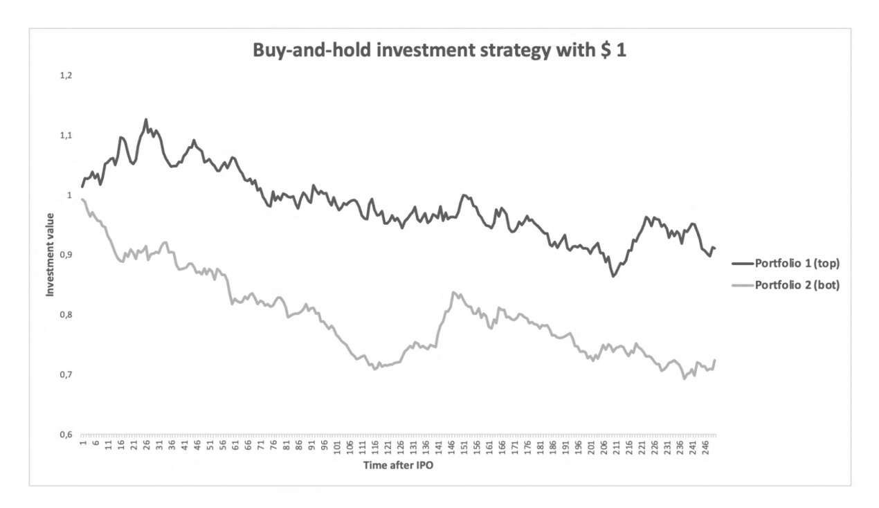
Figure 4.6: The development of $ 1 invested in portfolios 1 and 2 for one year. Portfolio 1 outperforms portfolio 2 significantly, indicating that firms with high E-scores on average yield larger first-year returns.

underwriting. The first-year abnormal buy-and-hold return is not necessarily an effect of underwriting. The much larger investment horizon allows many unrelated factors to influence the portfolio returns. However, it is interesting that portfolio 1 outperforms portfolio 2 with a large margin even with this longer investment horizon. We argue that firms with higher levels of environmental sustainability will perform better on the stock market due to a shifting sentiment in the global economy towards sustainability (Randall, 2020).